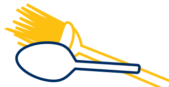
spoon, spatula or food brush