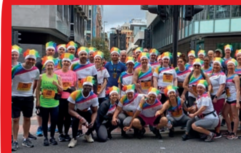
63 runners from bakers, Greenhalgh's, took part in Great Manchester Run