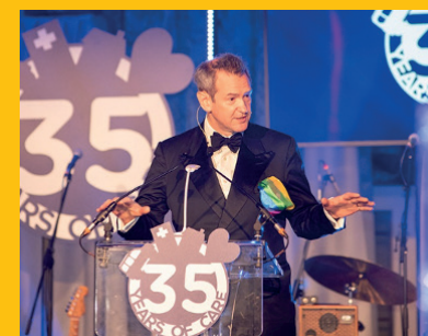
We celebrated 35 years of Care at our Anniversary Ball raising £590,000