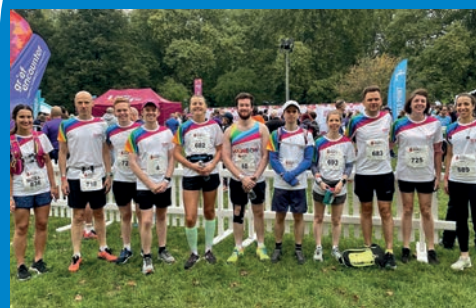
Staff at Macfarlanes selected us as their Charity of the Year