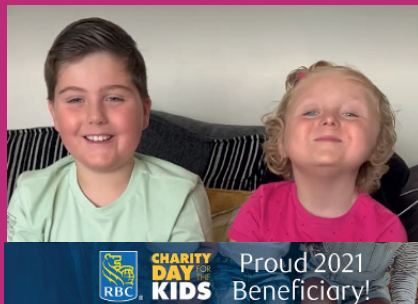
Staff at Royal Bank of Canada donated an amazing £162,500