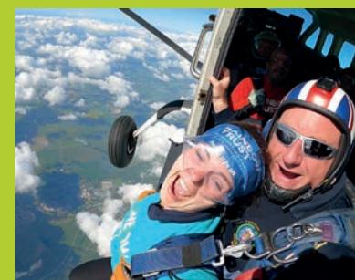
Rainbow Trust colleagues joined our SkyDive35 campaign raising over £5,000