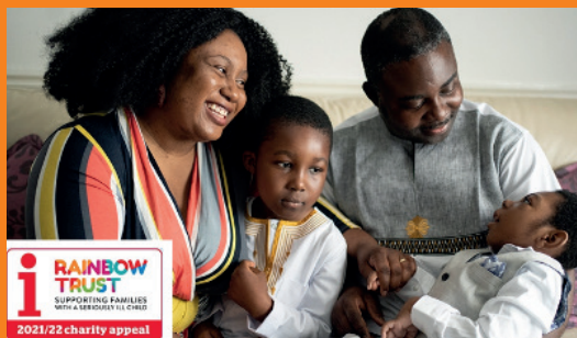
Generous i newspaper readers donated over £150,000