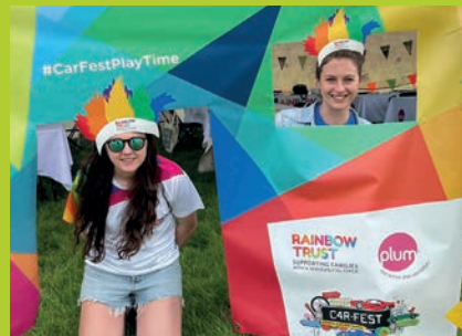
Incredible CarFest, created by radio presenter Chris Evans raised £151,000