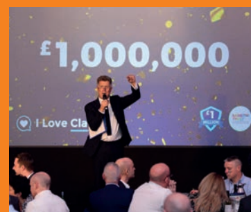
The fabulous ILC network reached £1million raised for children