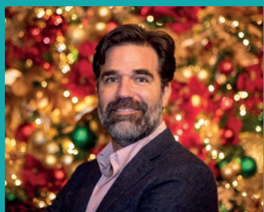
Rob Delaney joined us at our London Carol Concert