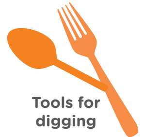
Tools for digging

Help the kids occupied and cool on a hot day!