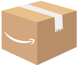
Old cardboard box