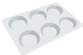
a muffin tray or bowls