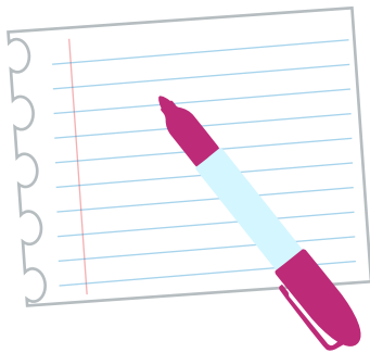
Notebook and pen